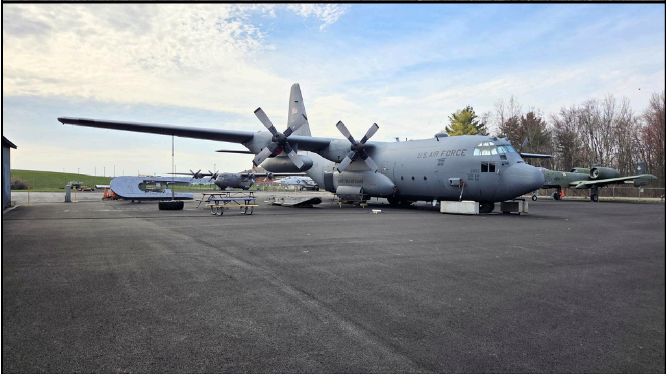
Top: From right to left, F-105, F-102, RA-5 and C-130 lined up in the Air Park. Bottom: Montana C-130 newly positioned in the center of the Air Park